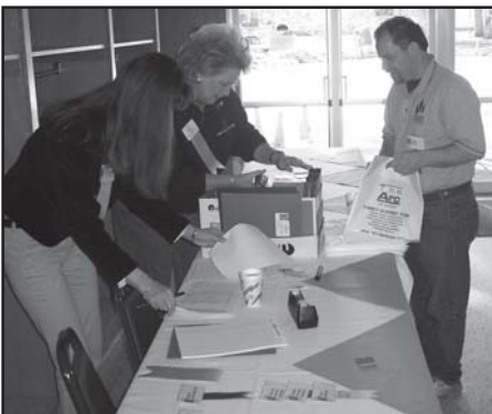
Members of the Junior League of Spokane provide volunteer assistance at the registration table.